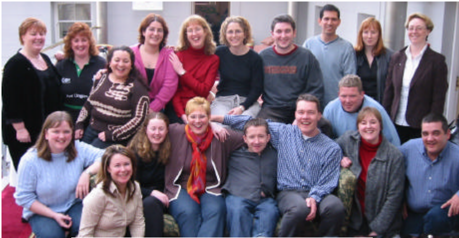
Pictured are the Prime coaches and delegates